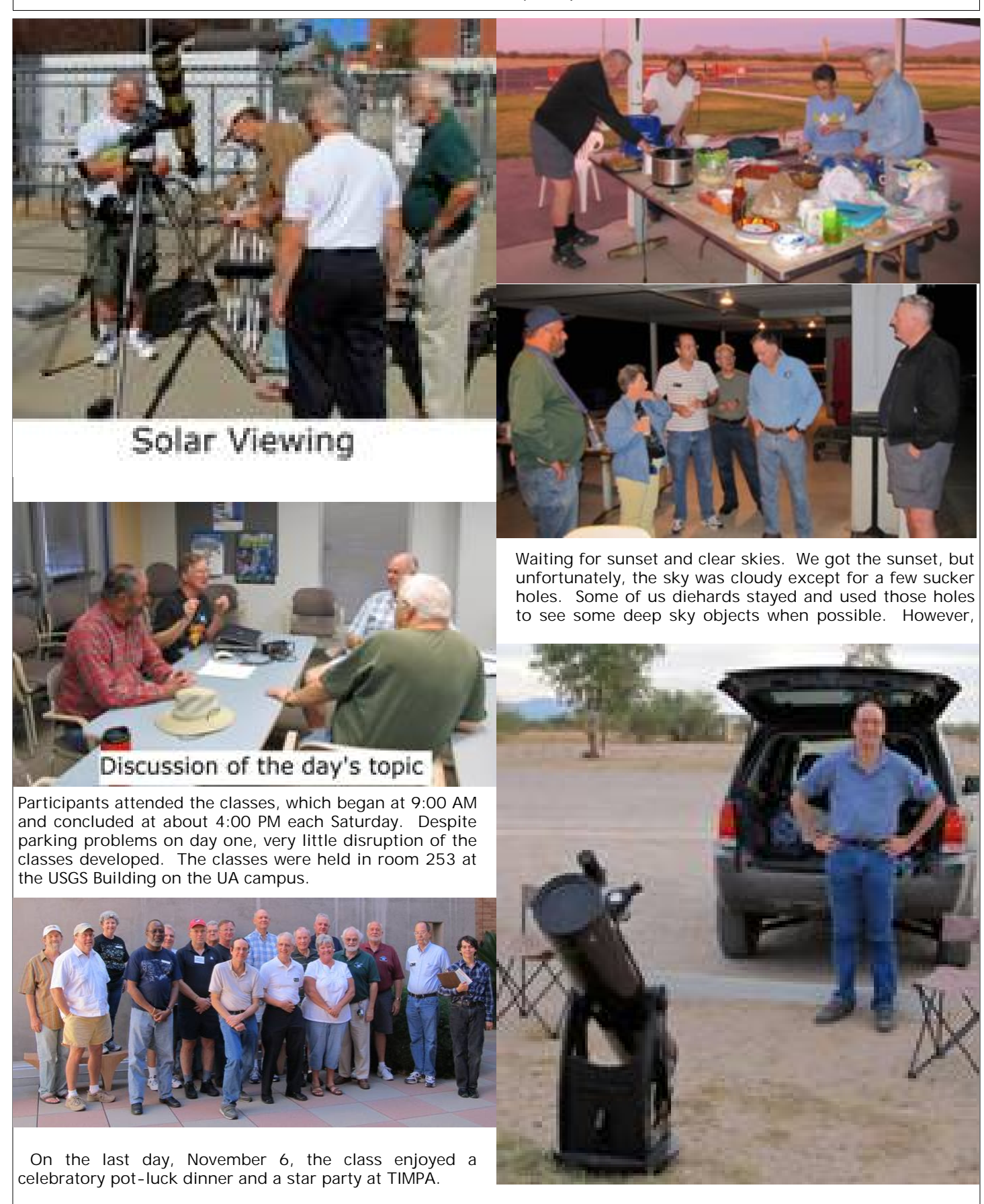
Club News (cont.)