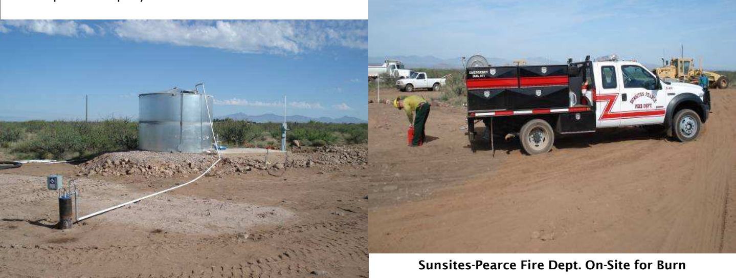
Temporary Well Set-up

8. Randy Maddox installed the reinforced concrete footer for the bathroom facility. This most important facility is now underway and it should proceed rapidly.