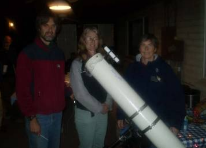
On March 30, accompanied with Project ASTRO programs, the telescope was dedicated to the use of children and families in our local school districts.

participate in Astronomical Outreach programs in area schools as well as SAS and TAAA events. After equipping the telescope with a Telrad Finder donated by Starizona, the telescope was ready for dedication.