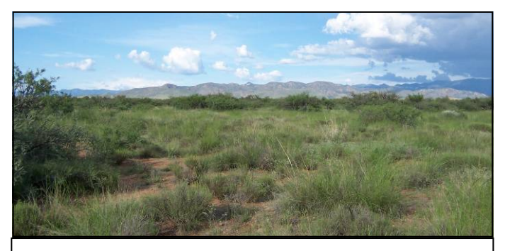
The property in the Sulphur Springs Valley where the TAAA Astronomy Complex will be constructed.

Now that the property has been transferred and belongs to the club, we are able to obtain our first building permit. Toward that end, the construction plans have been